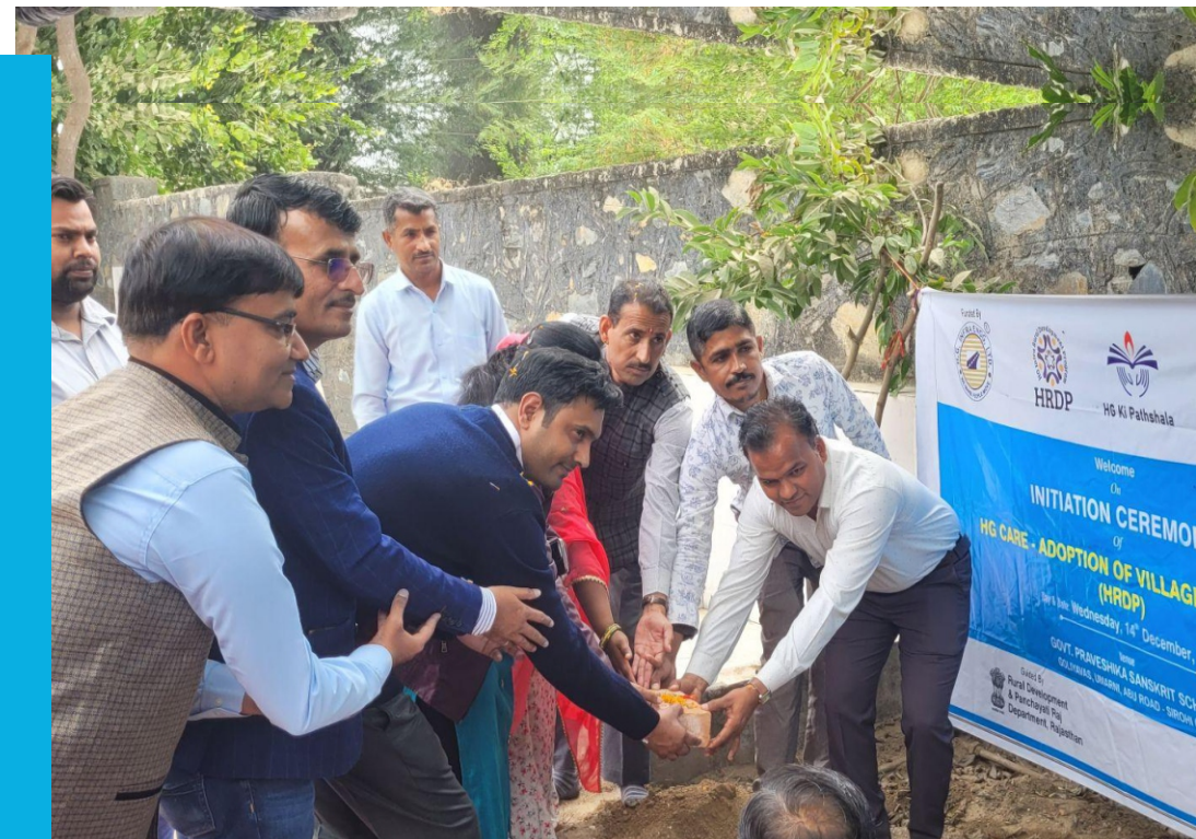
HRDP – Umarni, Abu Road, Sirohi, Rajasthan : 14 December 2022

Initiated rural development project at Umarni, Abu road, Sirohi, Rajasthan under our CSR project 'HG Care – Adoption of Villages' for overall development of the village covering focus areas - Infrastructure, Education, Livelihood, Healthcare and Natural Resource Management.