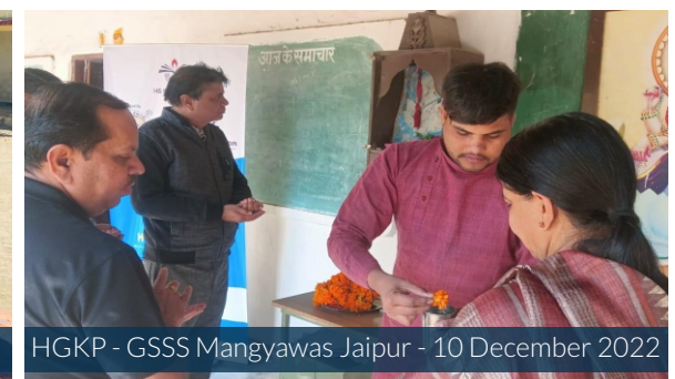
HGKP - GSSS Mangyawas Jaipur - 10 December 2022