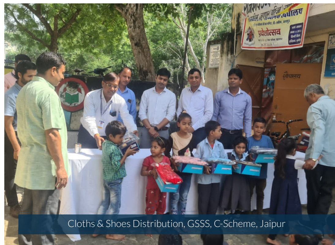
Cloths & Shoes Distribution, GSSS, C-Scheme, Jaipur