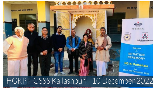
HGKP - GSSS Kailashpuri - 10 December 2022