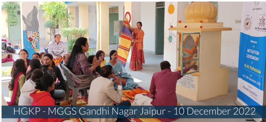
HGKP - MGGS Gandhi Nagar Jaipur - 10 December 2022

Initiated H.G. Ki Pathshala - Adoption of Schools Program in 14 Schools of Jaipur, Udaipur, Sirohi and Rajsamand districts of Rajasthan for the overall development of schools covering focus areas - Infrastructure Enhancement, Establishment of Smart Learning Ecosystem, Regular Engaging Learning Intervention & Capacity Building of Teachers & Principals.