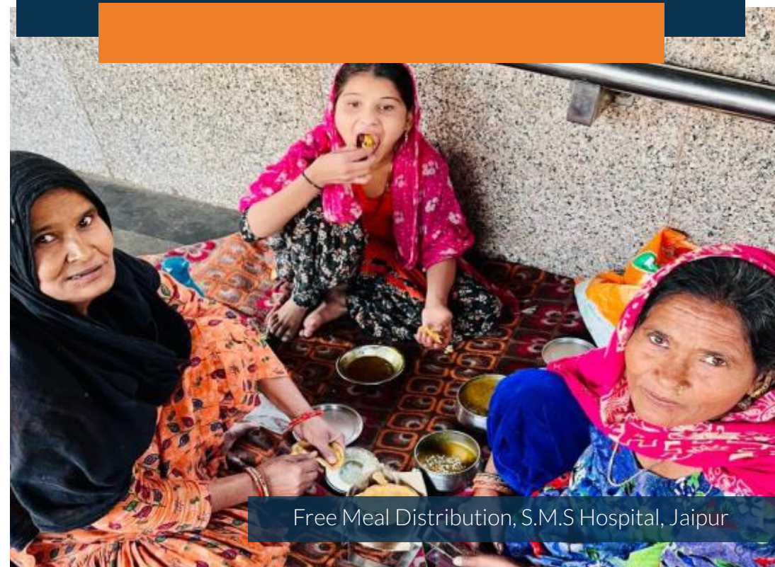
Free Meal Distribution, S.M.S Hospital, Jaipur