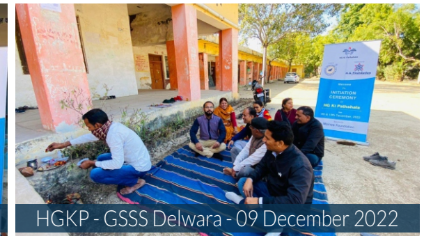
HGKP - GSSS Delwara - 09 December 2022