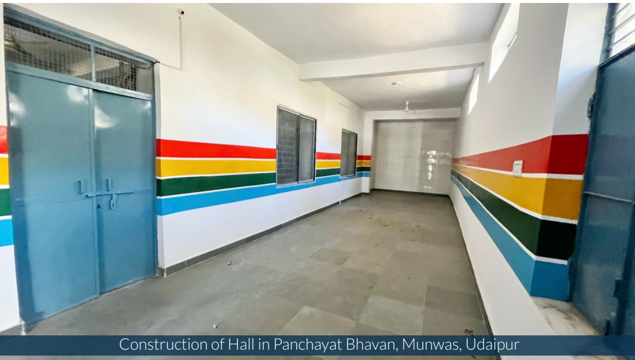
Construction of Hall in Panchayat Bhavan, Munwas, Udaipur