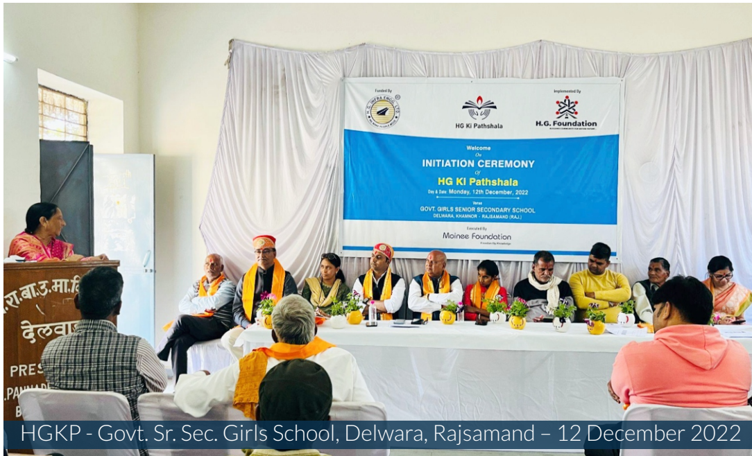
HGKP - Govt. Sr. Sec. Girls School, Delwara, Rajsamand - 12 December 2022