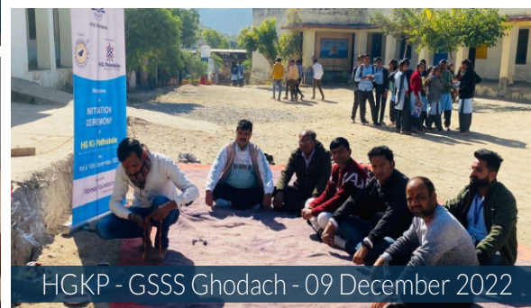
HGKP - GSSS Ghodach - 09 December 2022