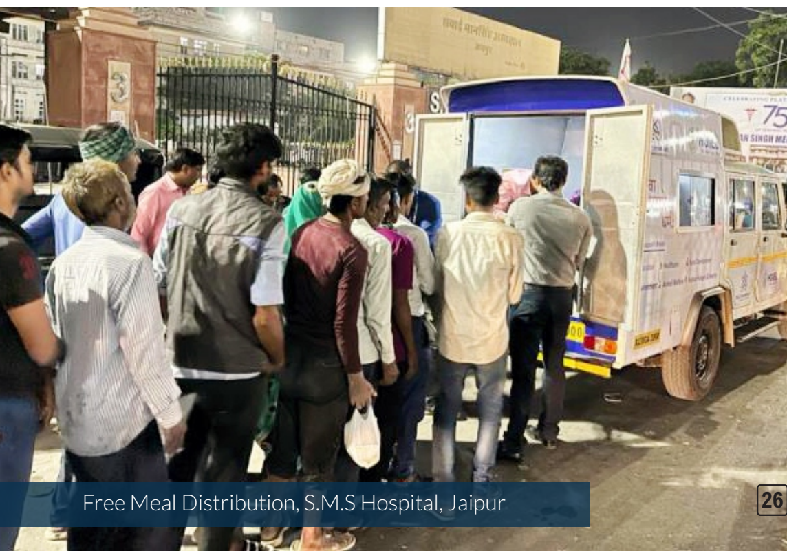
Free Meal Distribution, S.M.S Hospital, Jaipur

S.M.S Hospital and Janana Hospital, Jaipur, Rajasthan.