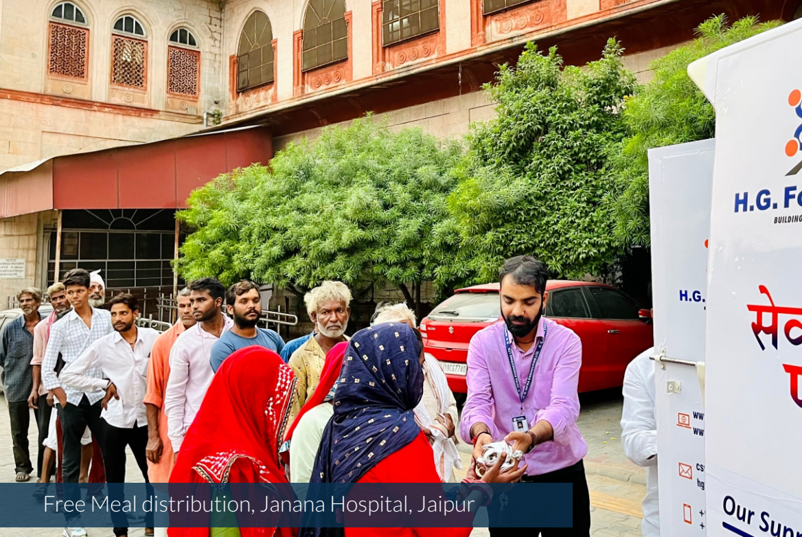
Free Meal distribution, Janana Hospital, Jaipur

Quarter Updates (October to December 2022)