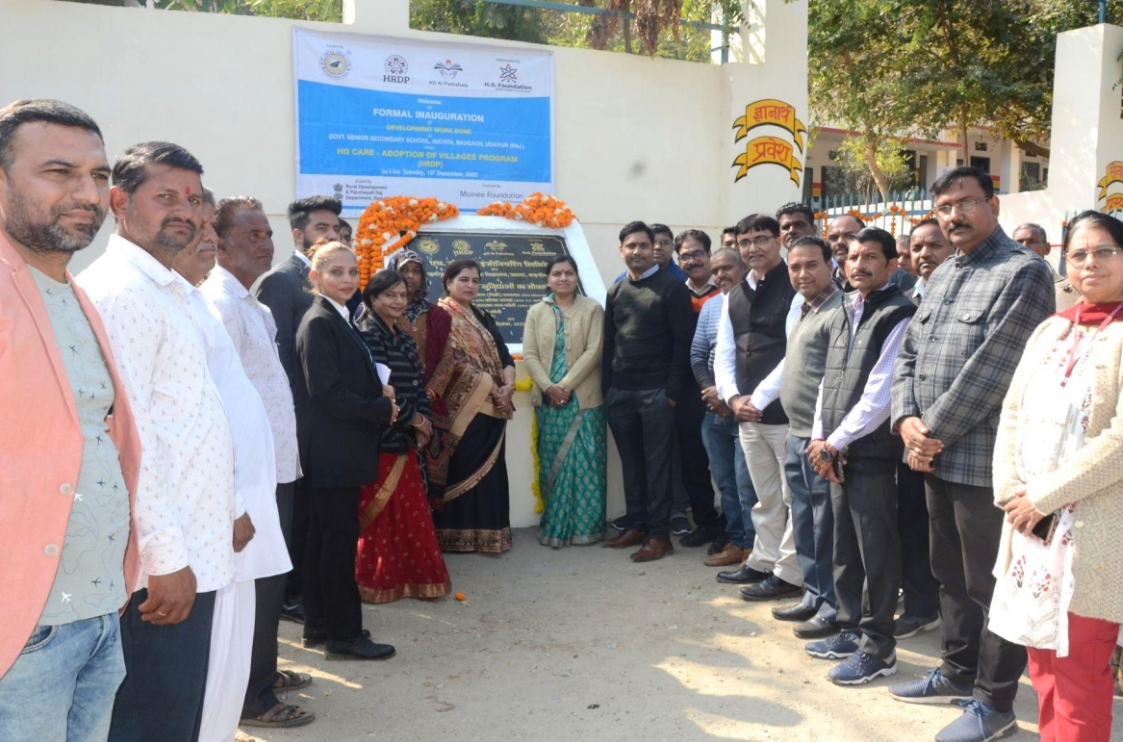
HRDP – Matata, Udaipur, Rajasthan : 13 December 2022