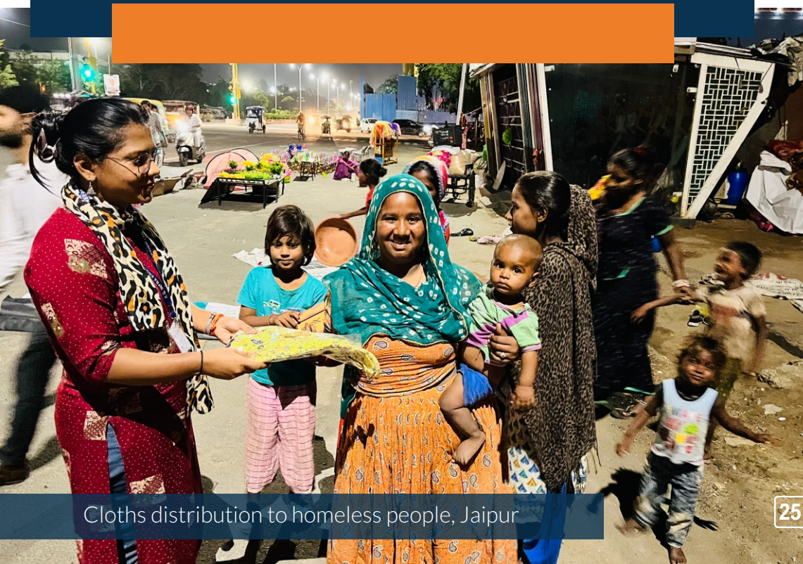
Cloths distribution to homeless people, Jaipur