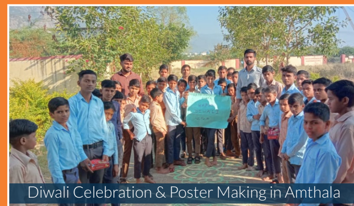
Diwali Celebration & Poster Making in Amthala