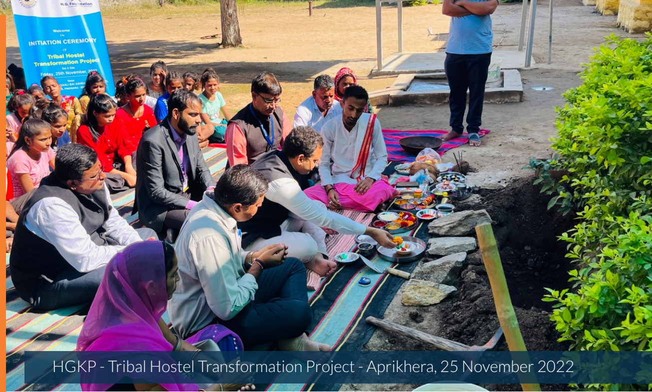
HGKP - Tribal Hostel Transformation Project - Aprikhera, 25 November 2022

Initiated H.G. Ki Pathshala – Adoption of Tribal Hostel Program at both Govt. Veer Bala Kali Bai Ashram Girls Hostel, Aapri Khera and Govt. Rana Punja Ashram Boys Hostel, Nichlagarh in the district of Sirohi, Rajasthan for overall development of the Hostel covering focus areas - Infrastructure enhancement, Establishment of ecosystem for smart education, Regular engaging learning interventions.