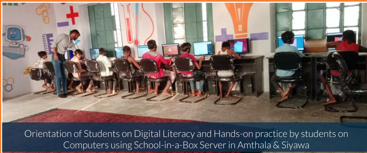
Orientation of Students on Digital Literacy and Hands-on practice by students on Computers using School-in-a-Box Server in Amthala & Siyawa