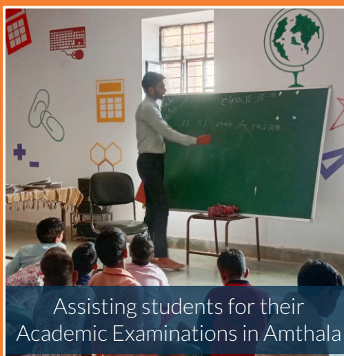
Assisting students for their Academic Examinations in Amthala