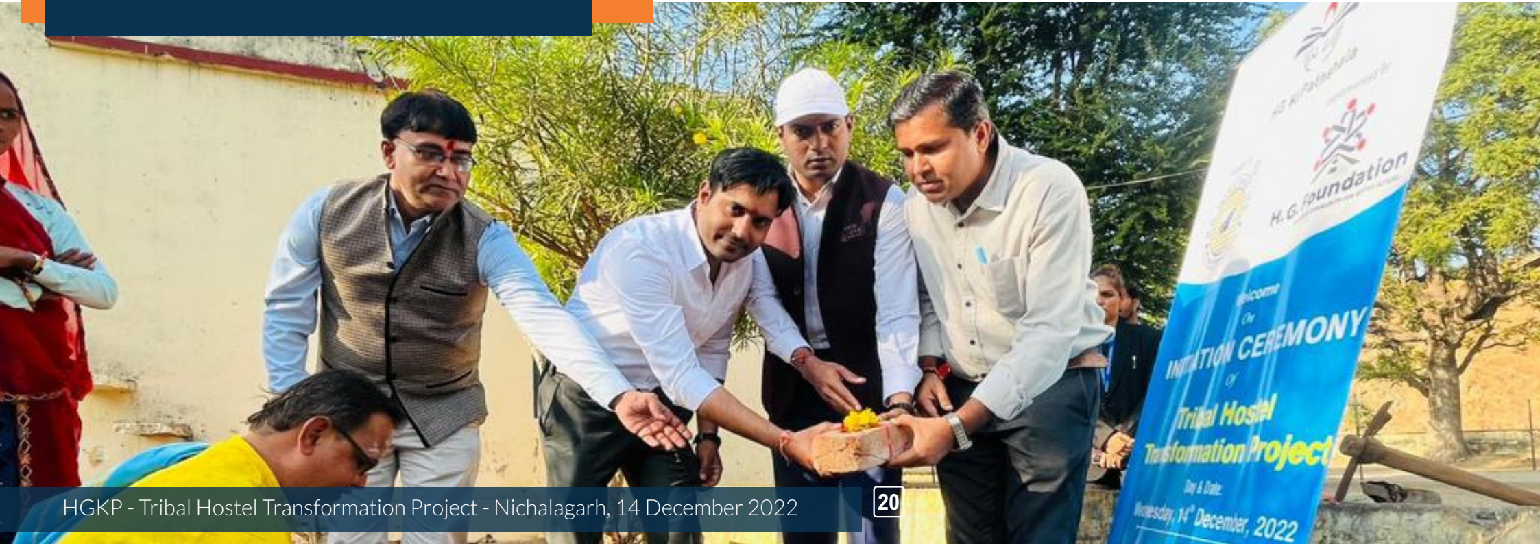
HGKP - Tribal Hostel Transformation Project - Nichlagarh, 14 December 2022