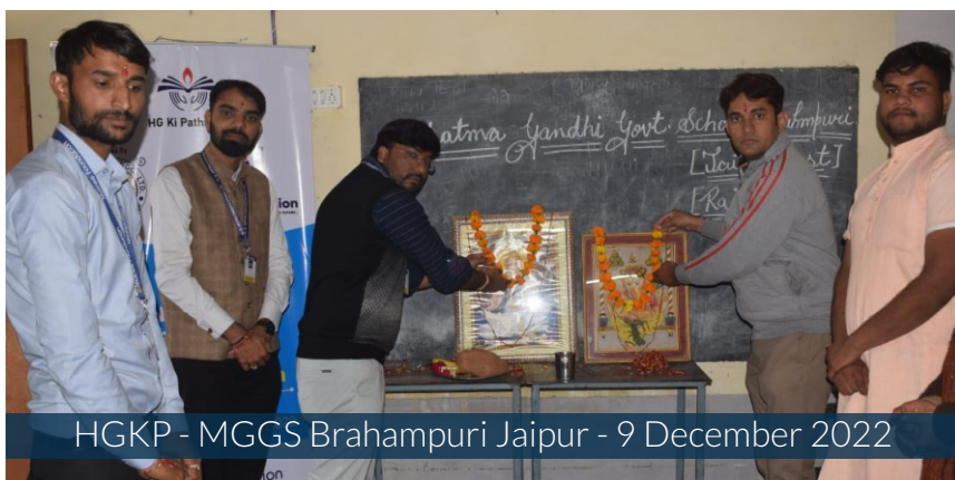
HGKP - MGGS Brahampuri Jaipur - 9 December 2022