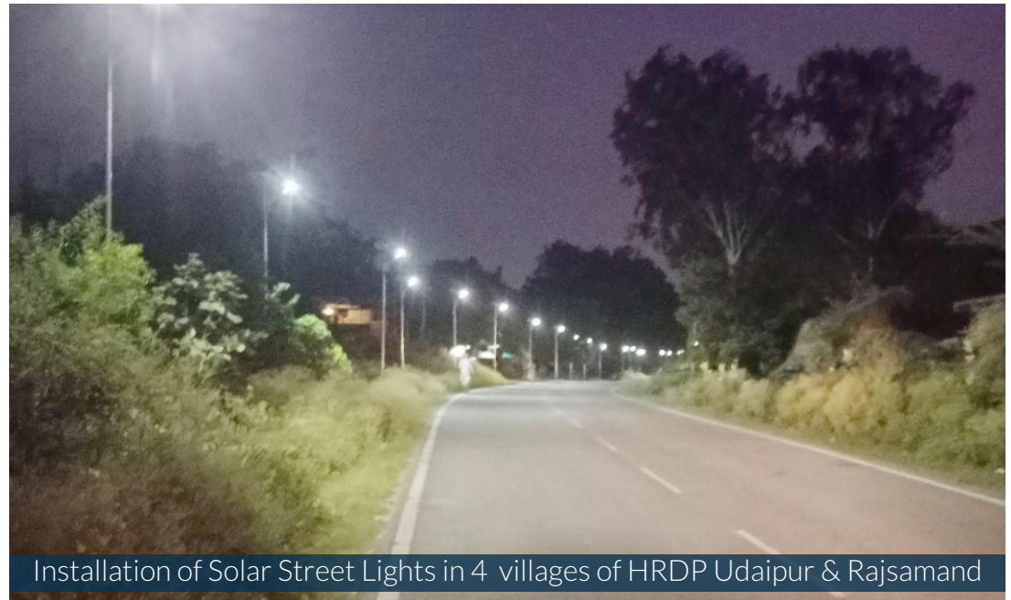
Installation of Solar Street Lights in 4 villages of HRDP Udaipur & Rajsamand