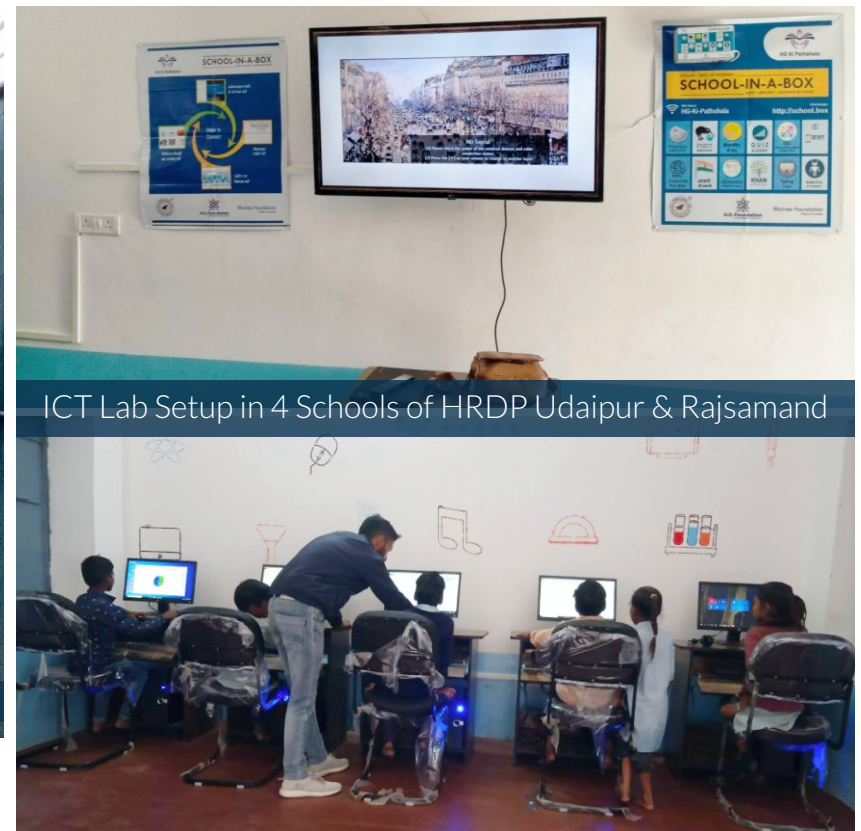
ICT Lab Setup in 4 Schools of HRDP Udaipur & Rajsamand