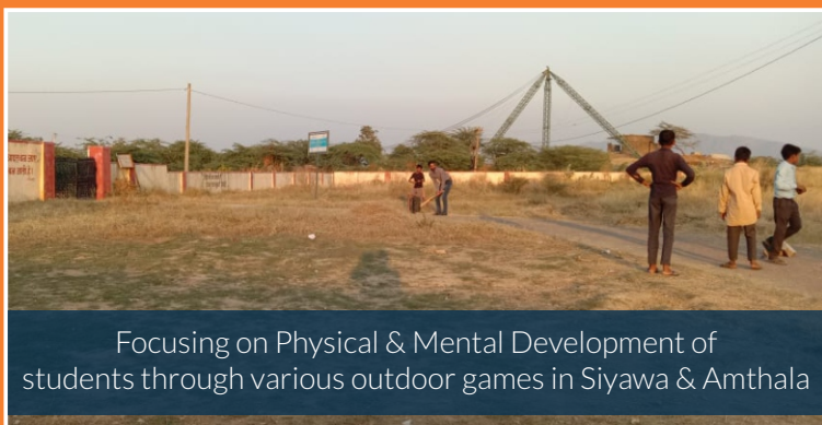
Focusing on Physical & Mental Development of students through various outdoor games in Siyawa & Amthala