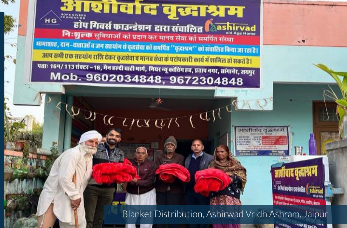
Blanket Distribution, Ashirwad Vridh Ashram, Jaipur